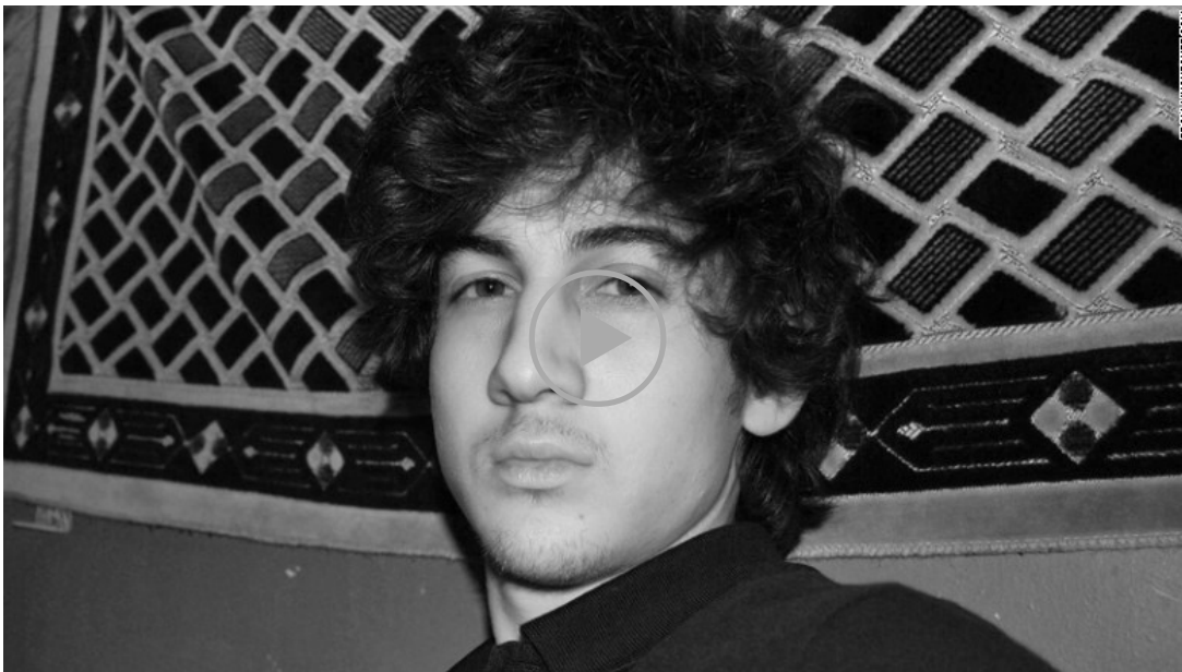
Boston Marathon terror attack timeline 02:44

(CNN)—Here is a look at the Boston Marathon terror attack . On April 15, 2013, double bombings near the finish line of the Boston Marathon killed three people and injured at least 264.